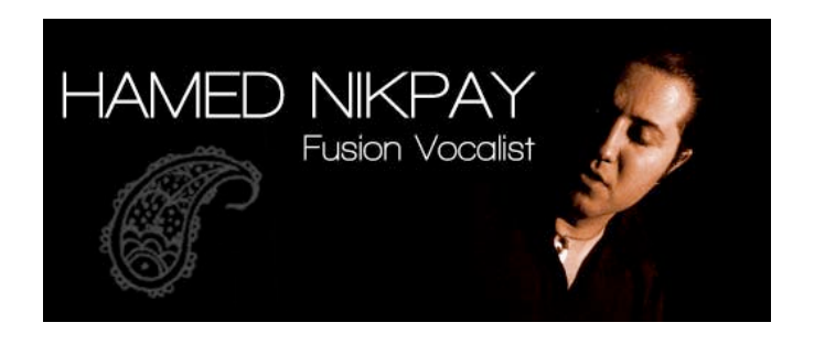
Nikpay Music Productions Proudly Presents:

MEDIA CONTACT: Bita Milanian (310) 746-5429 bita@bflybuzz.com